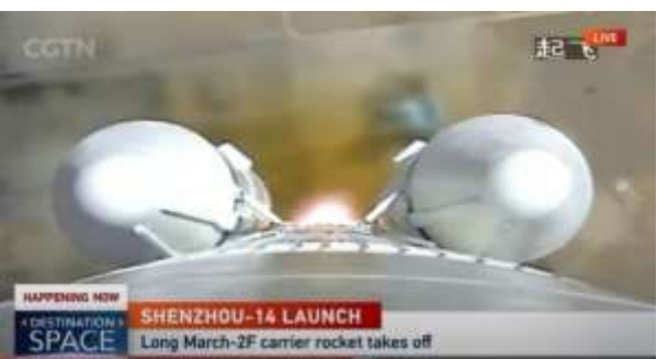
Lift-off CZ 2F with Shenzou 14 on June5, 2022