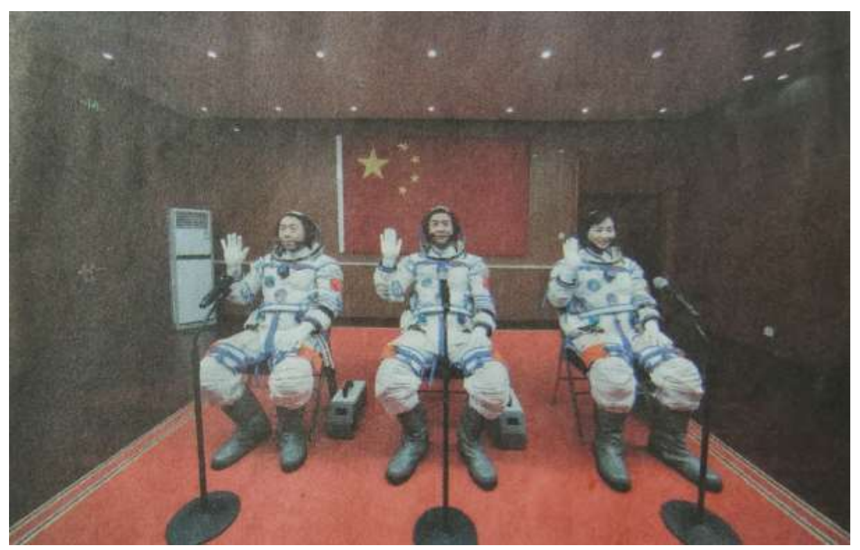
Chen Dong (in the middle) Liu Yang right and Cai Xuzhe left, just before the start of their 6-month Shenzhou 14 mission. [1]

On June 5, 2022 a launch celebration was held for the Shenzou-14 mission at the Jiuquan Cosmodrome, also marking the start of the Program 921 30 years ago and also the 20 anniversary of the Shenzhou 3 and 4 launches demonstrating Chinese ability to lift (dummy-) crews into orbit and bring them back unharmed as of 2002.